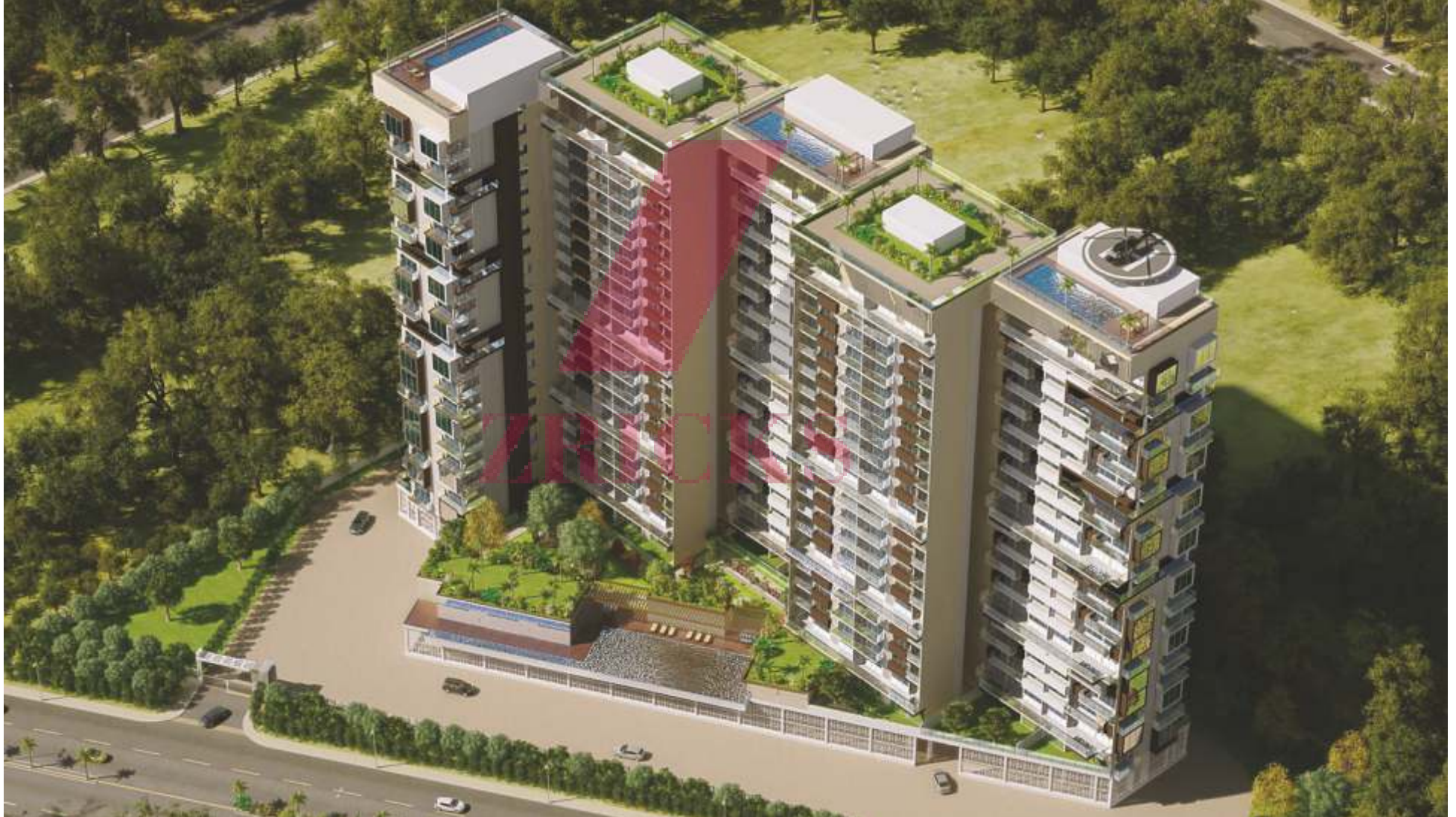
Emporis site view