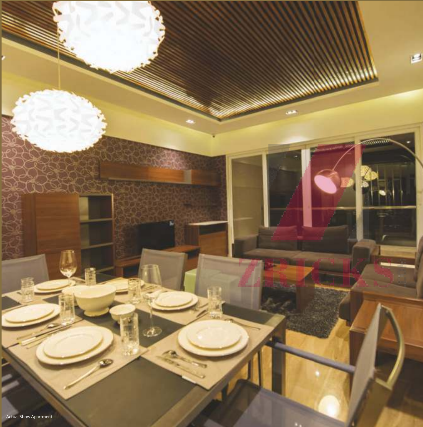
Actual Show Apartment